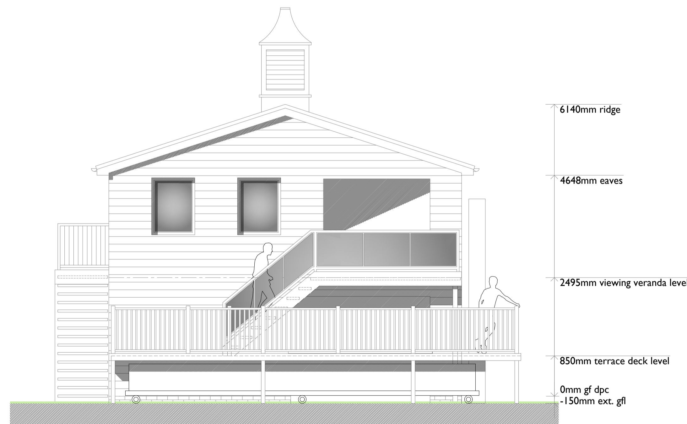
side elevation inc. viewing terrace (north facing)